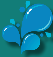
Water, sanitation and hygiene (WASH)