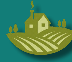
Agriculture & Rural Development