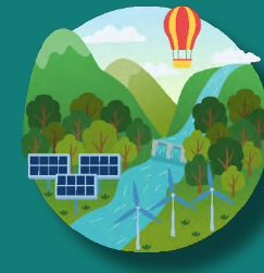
Energy & Environment