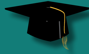
Education & Youth Development