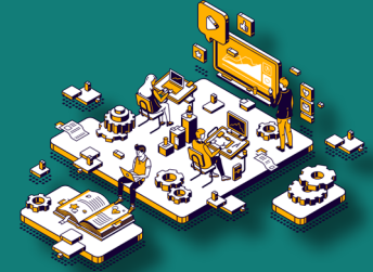
Capacity building and others